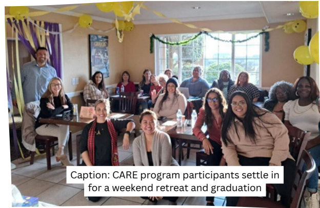
Caption: CARE program participants settle in for a weekend retreat and graduation