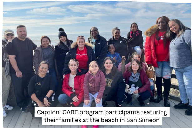
Caption: CARE program participants featuring their families at the beach in San Simeon

"The CARE Support Group graduation was a milestone, a reminder for me that the bond I formed with my prison family, and the gift of family I shared with them is still alive and it never faded. The laughter and the tears that filled up the room was surreal, and at the same time, a very familiar, comforting feeling. The reunion solidified that we needed this space and stay connected. We are at our best when amongst each other. Being free and free among us without judgment is the ultimate gift."