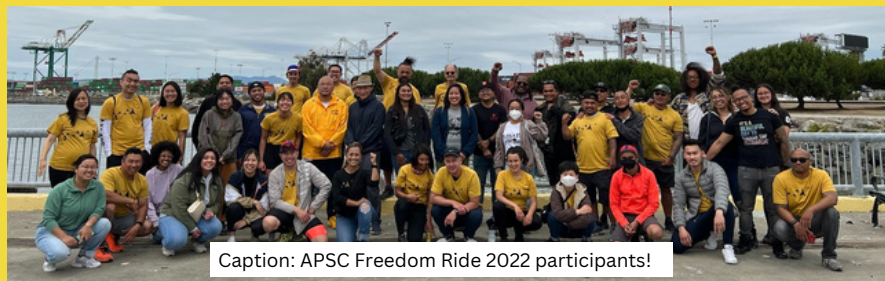
Caption: APSC Freedom Ride 2022 participants!