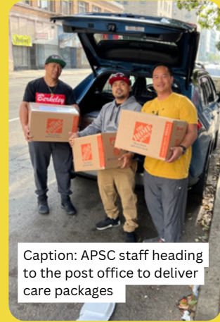
Caption: APSC staff heading to the post office to deliver care packages