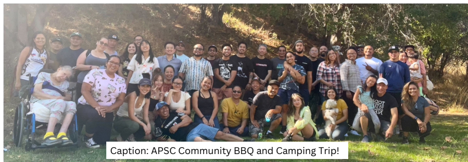
Caption: APSC Community BBQ and Camping Trip!